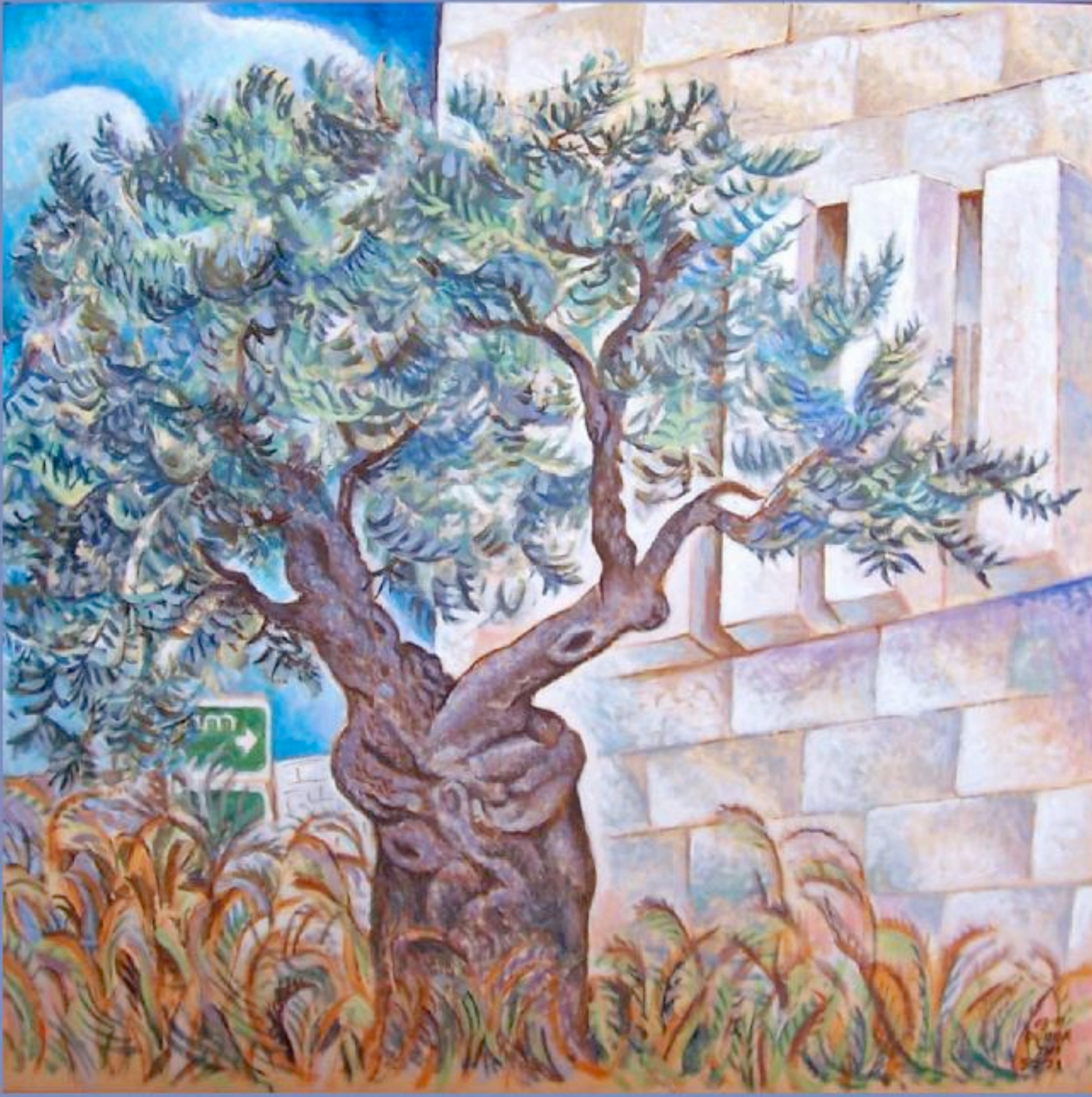
City Olive , acrylic on wood, 20"x20"